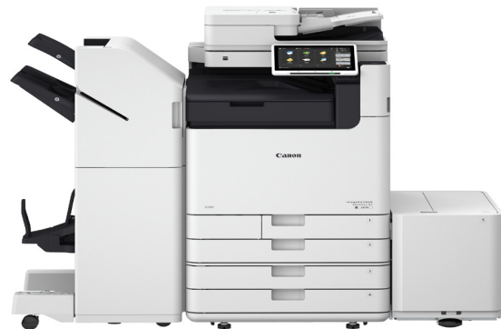
Canon imageRUNNER ADVANCE DX 6870i