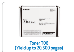
Toner T06 (Yield up to 20,500 pages)

Use of Canon GENUINE toner cartridges helps provide longer equipment life, high yields, reliable performance, high-quality output, and minimal jamming or issues.