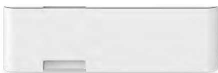
OPTIONAL CASSETTE AF-1 Item: 0732A032